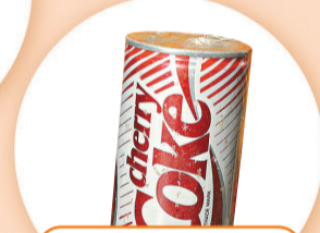
H. aluminum can