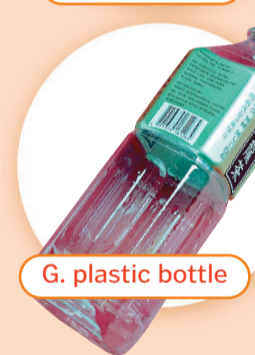
G. plastic bottle