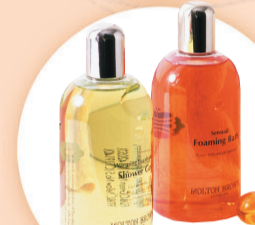
C. shower gel bottle