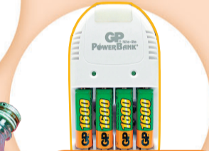
F. rechargeable batteries