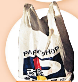
E. plastic bag