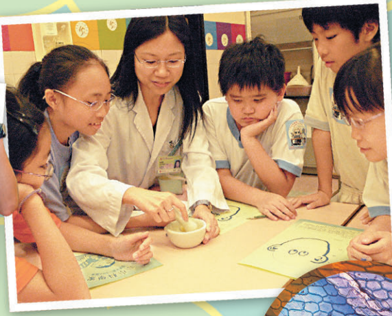
A wonderful sight under the microscope.