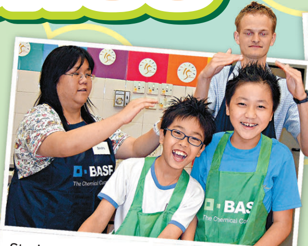
Students try out the home-made hair gel.