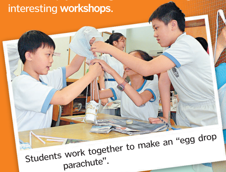
Students work together to make an "egg drop parachute".

BEING a scientist is a dream of many children. Students from Christian Alliance HC Chan Primary School enjoy learning science through interesting workshops.