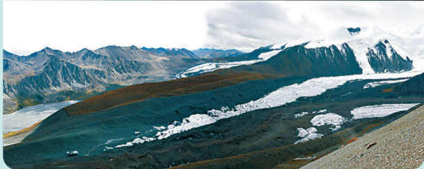
Two photos – one taken in 1981 (top) and the other in 2005 – show the retreating Halong Glacier of the Animegen Mountain on the Tibetan Plateau.