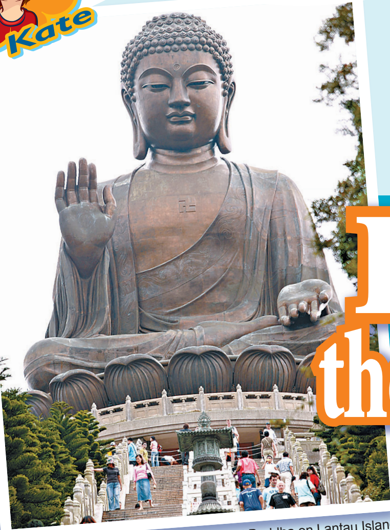
▲ The giant Buddha on Lantau Island.

B UDDHA'S birthday falls on the eighth day of the fourth month in the lunar calendar. It will be 12 May this year. Let's take the quiz and learn more about the key figure of Buddhism .