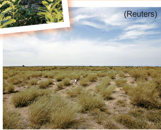
A general view of sandy soil threatened by desertification in the Homokhatsag region in southern Hungary.