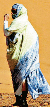
▲ A woman walks in the Sahara Desert in south-western Algeria.