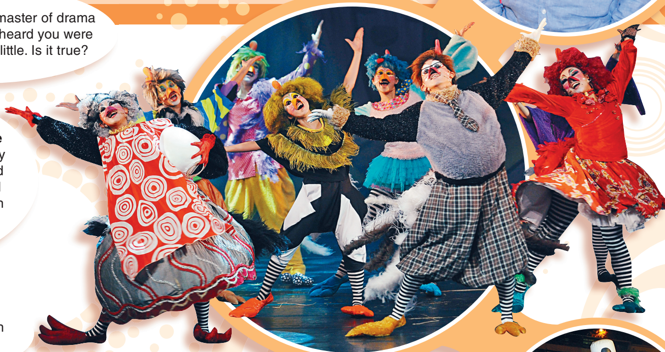
Performers from Paperwindmill Theatre give free shows for kids.