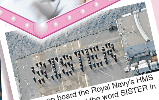
Sailors on board the Royal Navy's HMS Lancaster spelt out the word SISTER in a message to Prince George.