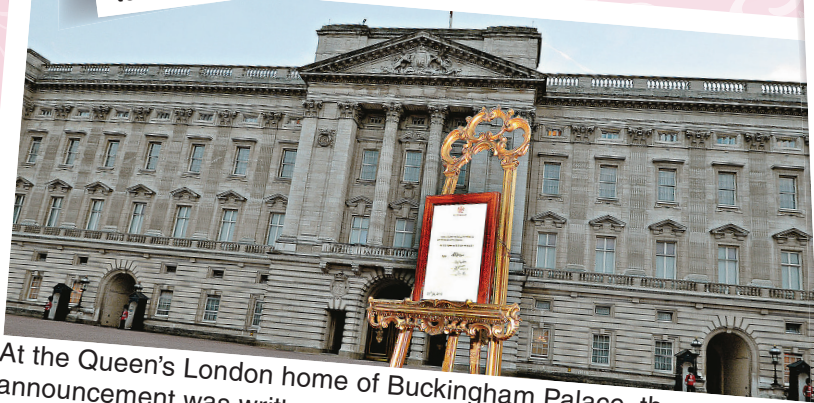
At the Queen's London home of Buckingham Palace, the announcement was written on special paper and mounted on a golden easel. It was put in front of the palace for the public to view.