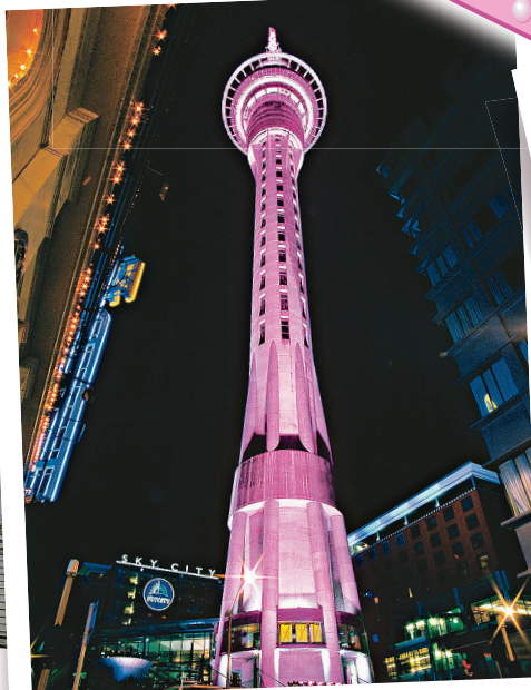
The Sky Tower in Auckland, New Zealand was lit up pink to mark the Duke and Duchess' new girl.