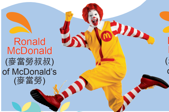
Ronald McDonald (麥當勞叔叔) of McDonald's (麥當勞)