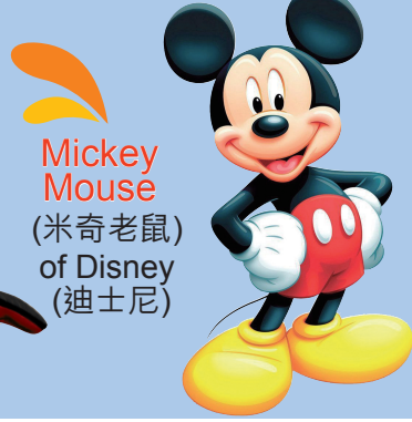
Mickey Mouse (米奇老鼠) of Disney (迪士尼)