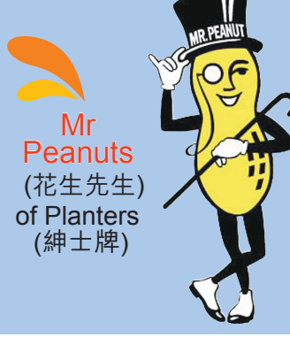
Mr. Peanuts (花生先生) of Planters (紳士牌)