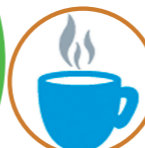
Coffee and Tea