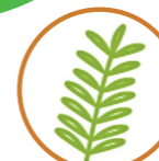
Herbs and spices