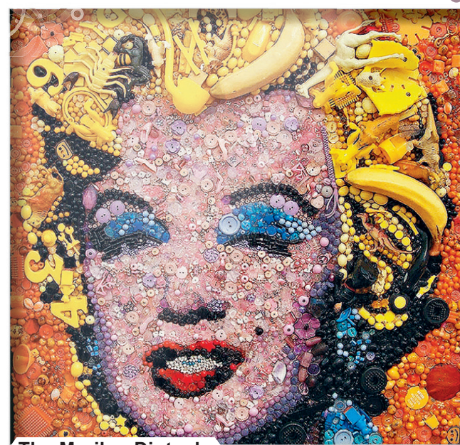
The Marilyn Diptych