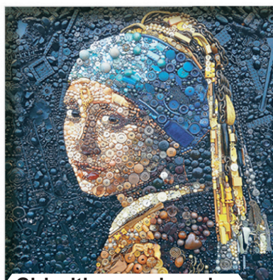
Girl with a pearl earring