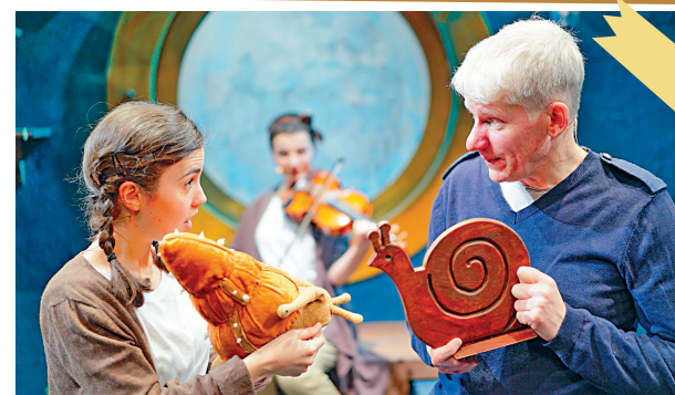
▲▼ The Snail and the Whale