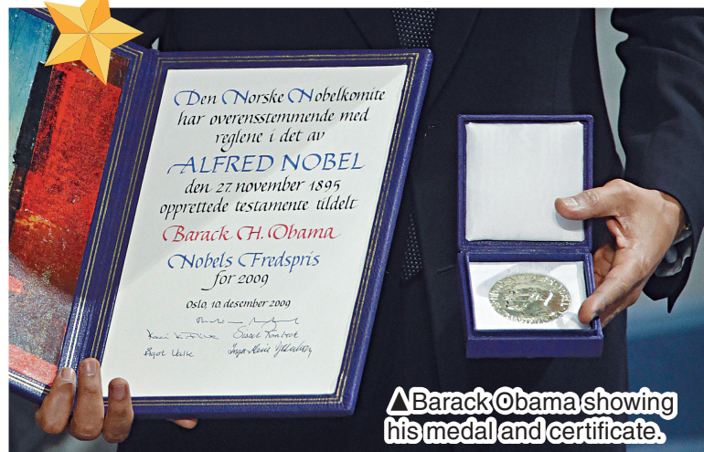
△Barack Obama showing his medal and certificate.

THE Nobel Prize is a very important annual prize that different scientists and activists can get because of their outstanding work. Originally, there were just five categories: Physics, Medicine, Chemistry, Literature and Peace. Later, a prize for Economics was added. Winners get a medal, a diploma, and money.