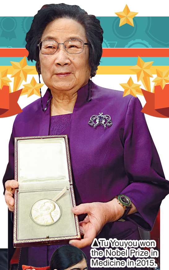
△Tu Youyou won the Nobel Prize in Medicine in 2015.