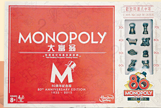
▲ Hong Kong's 80th anniversary edition, released in 2015.