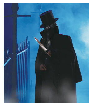
'Jack the Ripper' was described as a left-hander.

The Nazis (納粹), who conducted genocides killing 11 million people between 1933 and 1945, also believed left-handers should be wiped out. Their ideological belief was that left-handers had degenerated and lost their virtue.